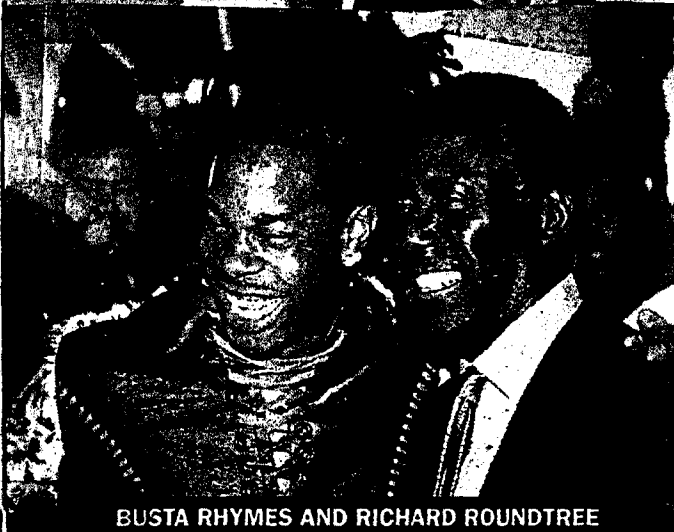
BUSTA RHYMES AND RICHARD ROUNDTREE